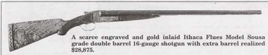
A scarce engraved and gold inlaid Ithaca Flues Model Sousa grade double barrel 16-gauge shotgun with extra barrel realized $28,875.