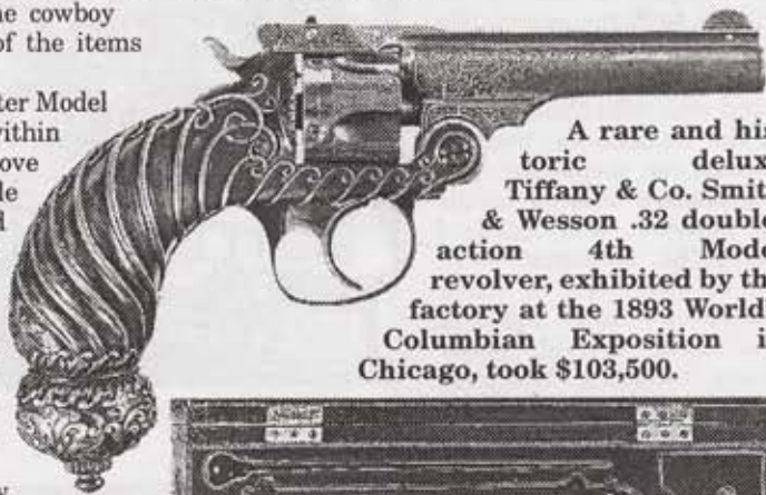
A rare and historic deluxe Tiffany & Co. Smith & Wesson .32 double-action 4th Model revolver, exhibited by the factory at the 1893 World's Columbian Exposition in Chicago, took $103,500.