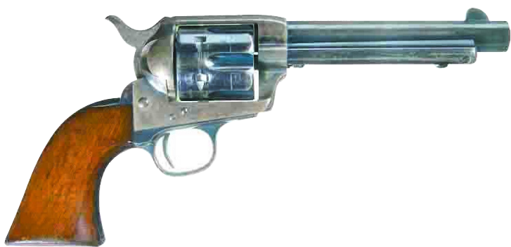
The finest known identified/documentated Spanish American War Rough Rider issued Colt single action Army revolver ($35/65,000).