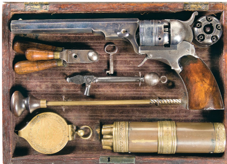
Cased Colt Paterson No. 2 belt model revolver with all accessories ( $250/380,000).