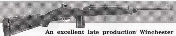
An excellent late production Winchester M1 carbine hit $4,025.

The gun market proved to be vibrant, as Rock Island experienced a record number of sealed preauction bids for a regional