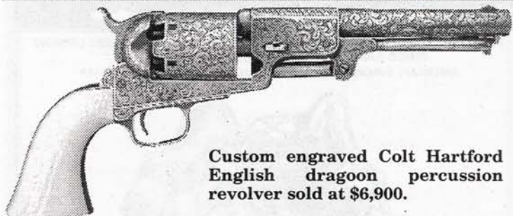
Custom engraved Colt Hartford English dragoon percussion revolver sold at $6,900.