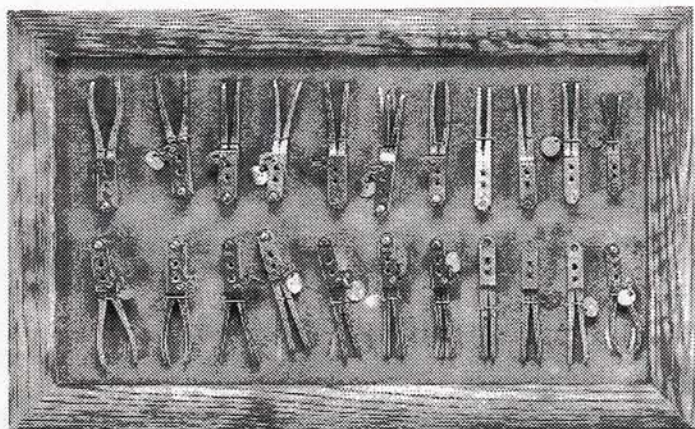
This set of 22 Colt bullet molds set off a bidding war that ended at $3,450