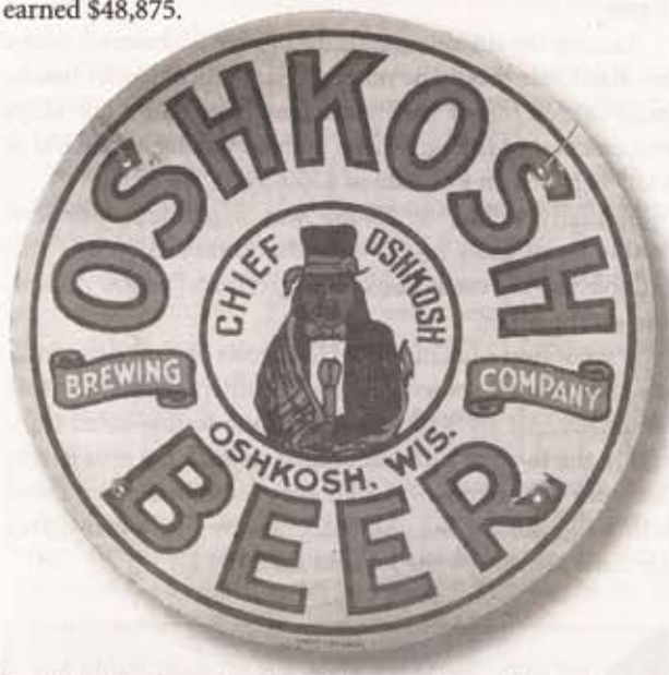
Rock Island Auction ventured out of its normal arena of expertise and offered pieces like this round convex steel Oshkosh Brewing Company sign, which reached a final sale price of $3,737.