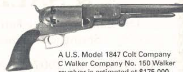
A U.S. Model 1847 Colt Company C Walker Company No. 150 Walker revolver is estimated at $175,000-$250,000.