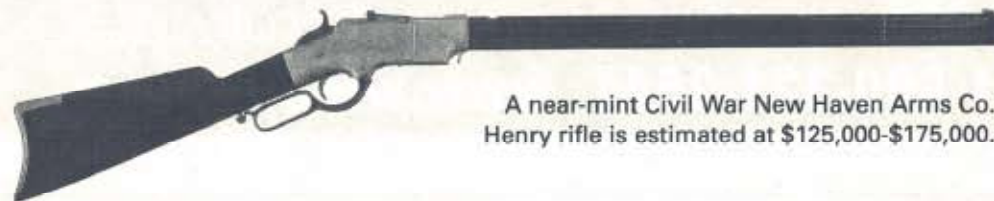
A near-mint Civil War New Haven Arms Co. Henry rifle is estimated at $125,000-$175,000.

A near-mint Civil War New Haven Arms Co. Henry rifle