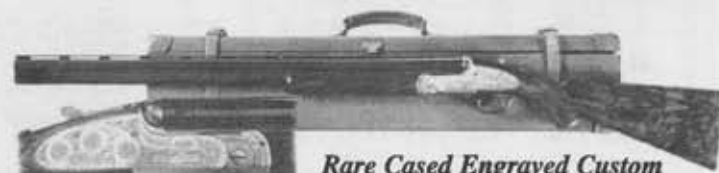
Rare Cased Engraved Custom Order Purdey Side Lock Over and Under Double Barrel Shotgun $65,000.00-$90,000.00