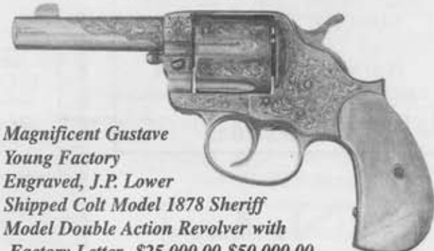
Magnificent Gustave Young Factory Engraved, J.P. Lower Shipped Colt Model 1878 Sheriff Model Double Action Revolver with Factory Letter $25,000.00-$50,000.00