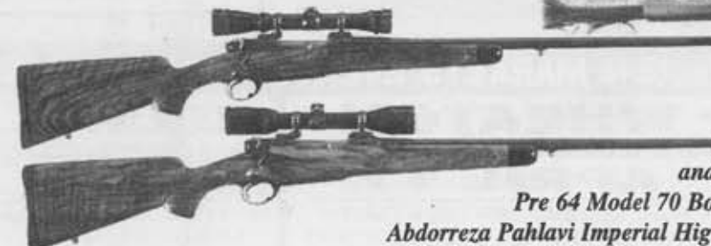
Royal Pair of Exquisite Custom Built and Engraved, Gold Inlaid Winchester Pre 64 Model 70 Bolt Action Rifles Owned by Abdorreza Pahlavi Imperial Highness of Iran $45,000.00-$90,000.00