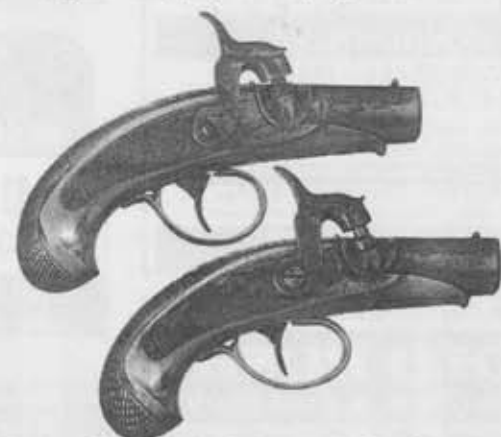
Extremely Rare Only Known Pair of Engraved Solid Silver Philadelphia Peanut Derringers $15,000-$25,000