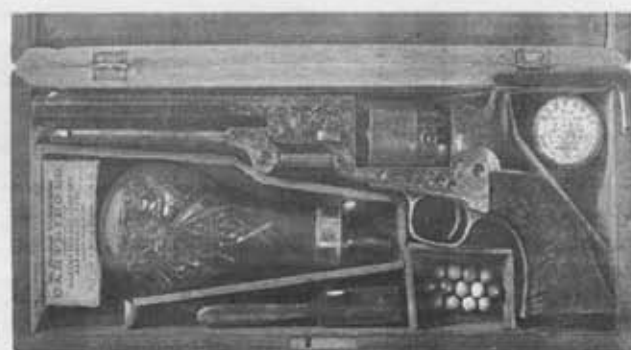
Exceptional Gustave Young Deluxe Engraved, Factory Cased and Civil War Officer Inscribed Colt Model 1851 Navy Revolver $50,000.00-$90,000.00

The April auction is catalogued in a full-color two-volume catalogue, which can be ordered through the mail ($60) or viewed online at www.rockislandauction.com . Rock Island Auction Company is currently seeking consignments for their upcoming auctions. For more information call 800-238-8022 and watch next weeks issue for a full page ad.