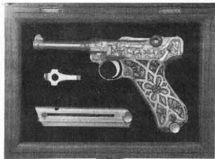
Cased, gold-plated, factory-engraved, carved ivory-stocked Krieghoff presentation Luger closed at $69,000.

Condition, quality, and diversity made this a must participate for a U.S. early martial collection including pre- and post-Civil War weapons. A spectacular Civil War New Haven Arms Co. Henry lever action rifle sold for an impressive $51,750. A rare engraved Spencer sporting rifle brought an impressive $19,550 and a rare Confederate second model Griswold and Gunnison revolver sold after a flurry of bidding for $21,850. Intense bidding drove up prices for early Martial Arms including an exceptional and rare U.S. Springfield Model 1882 Chaffee-Reese rifle selling for $8,050.