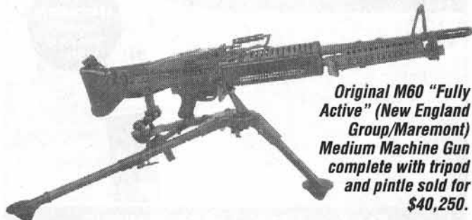
Original M60 "Fully Active" (New England Group/Maremont) Medium Machine Gun complete with tripod and pintle sold for $40,250.

The more than 300 U.S. military arms were highlighted with an impressive sale at $48,875 of a rare Pedersen device with metal case and U.S. Model 1903 Springfield Mark I rifle, a rare late WWII original inland "T3" carbine with M2 infrared sniper scope with accessories sold for $23,000, and a rare U.S. trials Colt Model 1907 Army contract semi-automatic pistol with factory letter sold at $14,950.